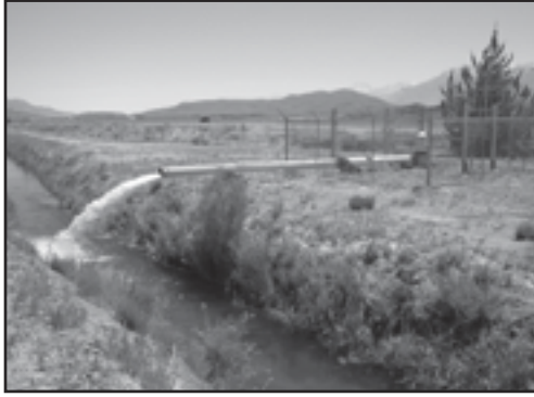
Pumping groundwater in Big Pine

Following a three day evidentiary hearing in April and a strong ruling in June, Inyo County Superior Court Judge Lee Cooper on July 25, 2005 brought out the 'big stick'