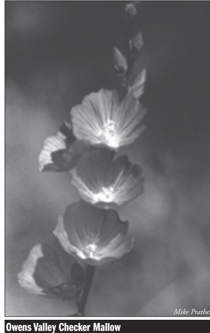
Owens Valley Checker Mallow

Once the LORP is implemented, we will be in place to compare future bird monitoring data to our existing three years of baseline data. By repeating our methods consistently over the long term, we will be able to provide the LORP process with one measure of how successful the rewatering and proposed land management activities are in reaching project goals. And in the same way that monitoring our health, our teeth, our cars and our education assists us in reaching our personal goals, the Lower Owens River and the birds that reside there will probably be better off for it.