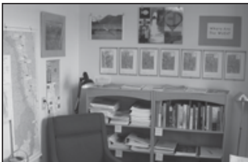
The new OVC Visitor Center in Lone Pine, CA.

Newly elected LA Mayor Antonio Villaraigosa and his appointed LADWP Board of Commissioners have stated publicly that they plan to work with the Owens Valley communities to solve current problems and to reduce the adversarial relationship that has existed over the past years. OVC is planning to conduct a workshop with the new Board to introduce them to the Owens Valley Committee and its goals. They will in turn be invited to visit with us in the Owens Valley to tour and discuss groundwater pumping problems, the re-watering of the Lower Owens River and the wildlife that has returned to Owens Lake and is in need of protection.