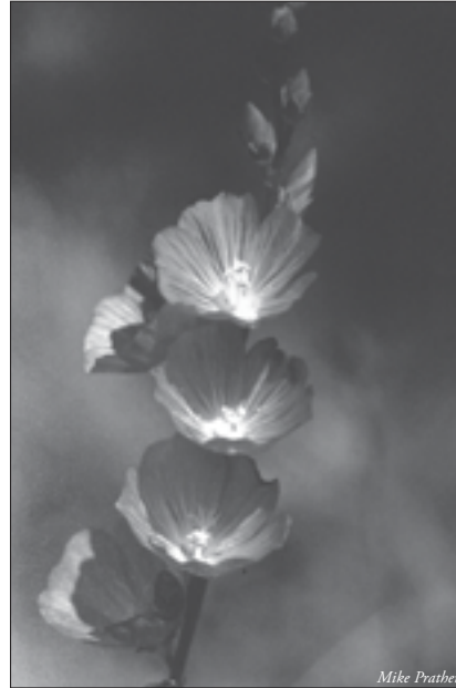
Owens Valley Checker Mallow

Once the LORP is implemented, we will be in place to compare future bird monitoring data to our existing three years of baseline data. By repeating our methods consistently over the long term, we will be able to provide the LORP process with one measure of how successful the rewatering and proposed land management activities are in reaching project goals. And in the same way that monitoring our health, our teeth, our cars and our education assists us in reaching our personal goals, the Lower Owens River and the birds that reside there will probably be better off for it.