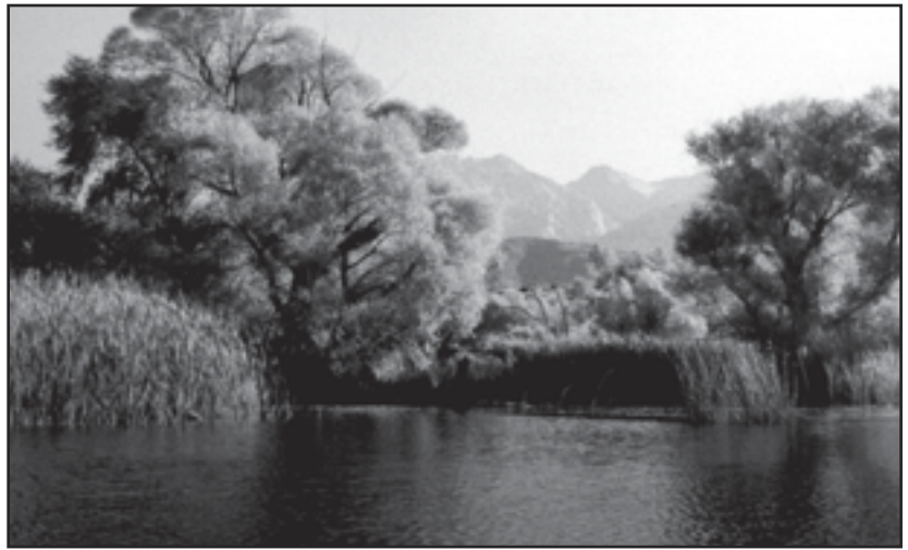
The Owens River Near Lone Pine